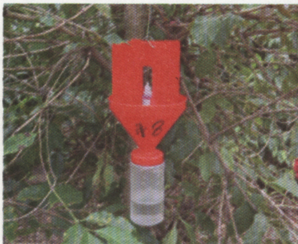
The coffee berry borer trap established in a plantation